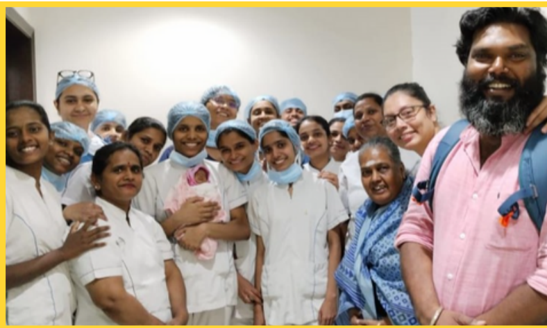
THE WARRIORS: NICU TEAM WITH THE FIGHTER AND HER FAMILY

Despite of all the struggles and challenges, the New year brought in a ray of hope as she started showing signs of improvement She was now active, tolerated oral feeds, responded to voice and sounds around her and became fond of cuddles and love. She was given Kangaroo mother care which was the happiest site to see, the most awaited moment for a mother to hold her little one in her arms. She lay close to her mother's warmth, comfortably listening to the songs her mother sang for her. 16th February 2024 was the victorious day as the fighter had finally won the 4 months battle between life and death. She was discharged and made way towards home in the arms of her parents.